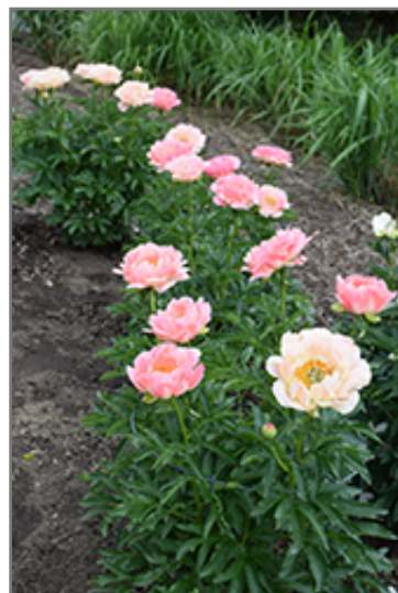
Coral Sunset Peony in bloom

This plant does best in full sun to partial shade. It does best in average to evenly moist conditions, but will not tolerate standing water. It is not particular as to soil pH, but grows best in rich soils. It is somewhat tolerant of urban pollution. This particular variety is an interspecific hybrid. It can be propagated by division; however, as a cultivated variety, be aware that it may be subject to certain restrictions or prohibitions on propagation.