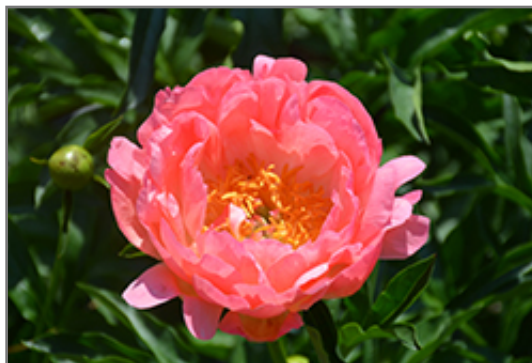
Coral Sunset Peony flowers