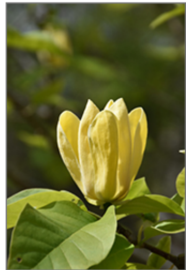
Yellow Bird Magnolia flowers