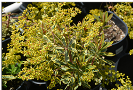
Ascot Rainbow Variegated Spurge flowers