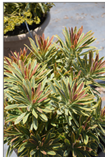
Ascot Rainbow Variegated Spurge foliage

This is a relatively low maintenance plant, and should be cut back in late fall in preparation for winter. Deer don't particularly care for this plant and will usually leave it alone in favor of tastier treats. It has no significant negative characteristics.