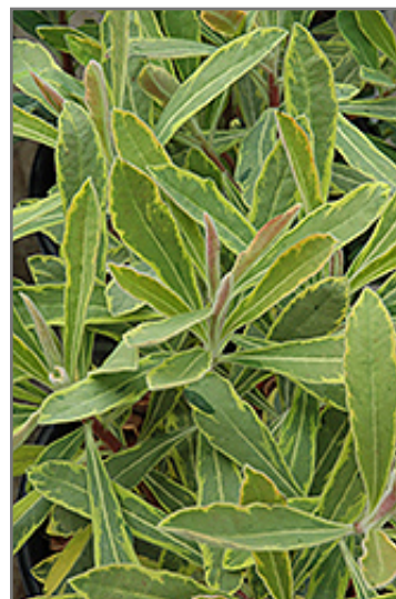
Ascot Rainbow Variegated Spurge foliage

Ascot Rainbow Variegated Spurge is a fine choice for the garden, but it is also a good selection for planting in outdoor pots and containers. Because of its height, it is often used as a 'thriller' in the 'spiller-thriller-filler' container combination; plant it near the center of the pot, surrounded by smaller plants and those that spill over the edges. It is even sizeable enough that it can be grown alone in a suitable container. Note that when growing plants in outdoor containers and baskets, they may require more frequent waterings than they would in the yard or garden. Be aware that in our climate, this plant may be too tender to survive the winter if left outdoors in a container. Contact our experts for more information on how to protect it over the winter months.