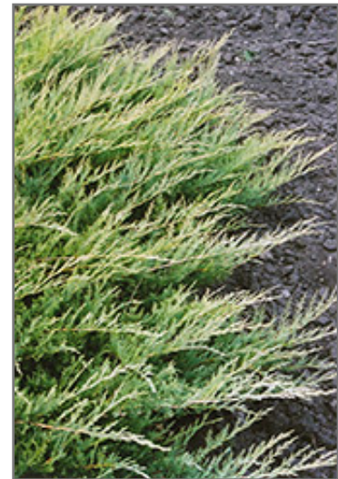
Broadmoor Juniper foliage