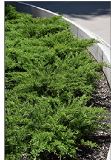
Broadmoor Juniper