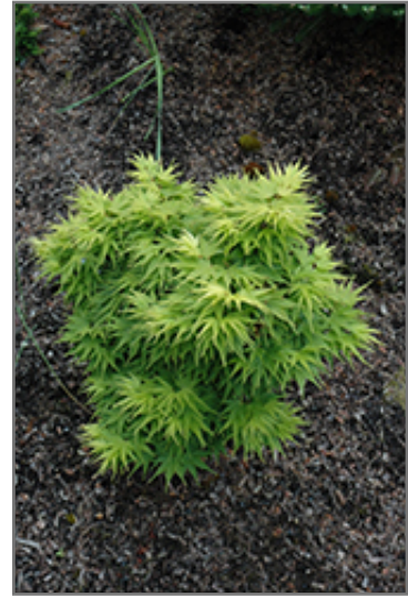
Mikawa Yatsubusa Japanese Maple

This tree should be grown in a location with partial shade and which is shaded from the hot afternoon sun. It prefers to grow in average to moist conditions, and shouldn't be allowed to dry out. It is not particular as to soil pH, but grows best in rich soils. It is somewhat tolerant of urban pollution, and will benefit from being planted in a relatively sheltered location. Consider applying a thick mulch around the root zone in winter to protect it in exposed locations or colder microclimates. This is a selected variety of a species not originally from North America.