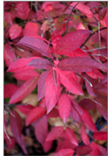
Henry's Garnet Virginia Sweetspire in fall

This shrub performs well in both full sun and full shade. It is an amazingly adaptable plant, tolerating both dry conditions and even some standing water. It is not particular as to soil type or pH. It is somewhat tolerant of urban pollution. This is a selection of a native North American species.