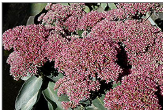
Autumn Delight Sedum flowers

Autumn Delight Sedum is a dense herbaceous perennial with an upright spreading habit of growth. Its relatively coarse texture can be used to stand it apart from other garden plants with finer foliage.