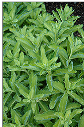
Autumn Delight Sedum foliage

Autumn Delight Sedum is a fine choice for the garden, but it is also a good selection for planting in outdoor pots and containers. With its upright habit of growth, it is best suited for use as a 'thriller' in the 'spiller-thriller-filler' container combination; plant it near the center of the pot, surrounded by smaller plants and those that spill over the edges. Note that when growing plants in outdoor containers and baskets, they may require more frequent waterings than they would in the yard or garden.