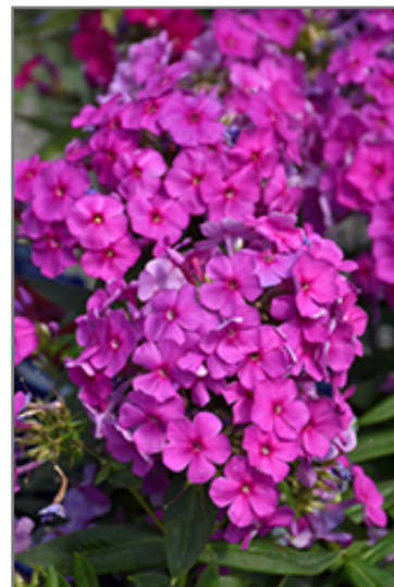
Purple Flame Garden Phlox flowers