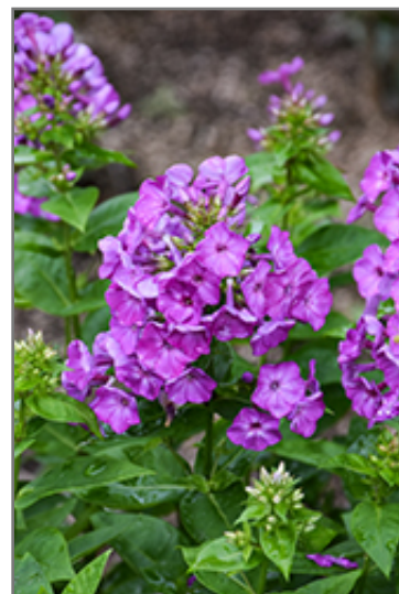
Purple Flame Garden Phlox flowers

Purple Flame Garden Phlox is recommended for the following landscape applications;