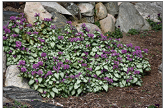
Purple Dragon Lamium in bloom