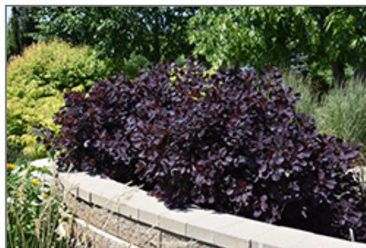
Royal Purple Smokebush