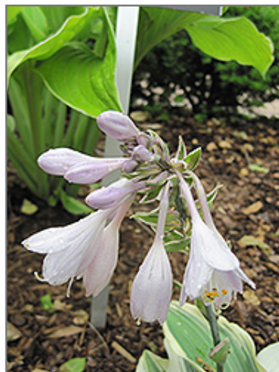
Blue Ivory Hosta flowers

This plant does best in partial shade to shade. It prefers to grow in average to moist conditions, and shouldn't be allowed to dry out. It is not particular as to soil type or pH. It is somewhat tolerant of urban pollution. This particular variety is an interspecific hybrid. It can be propagated by division; however, as a cultivated variety, be aware that it may be subject to certain restrictions or prohibitions on propagation.