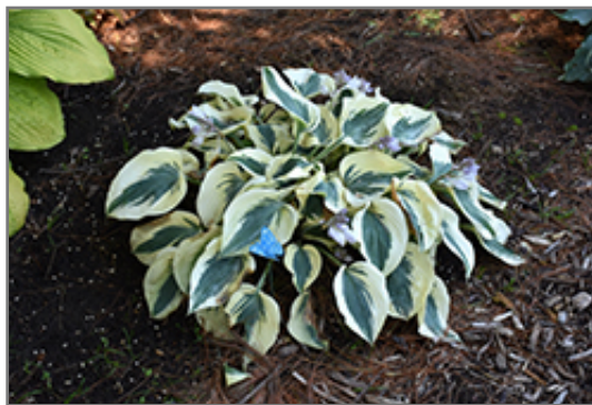
Blue Ivory Hosta