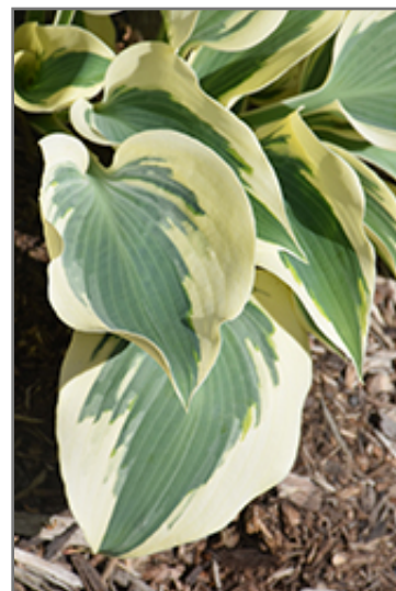
Blue Ivory Hosta foliage