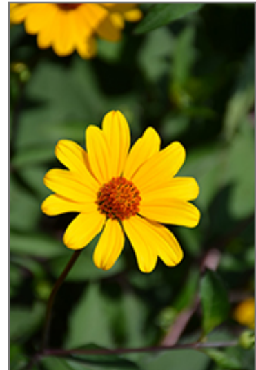
Summer Nights False Sunflower flowers

Summer Nights False Sunflower is recommended for the following landscape applications;