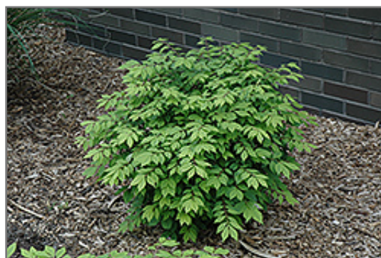
Little Moses Dwarf Burning Bush