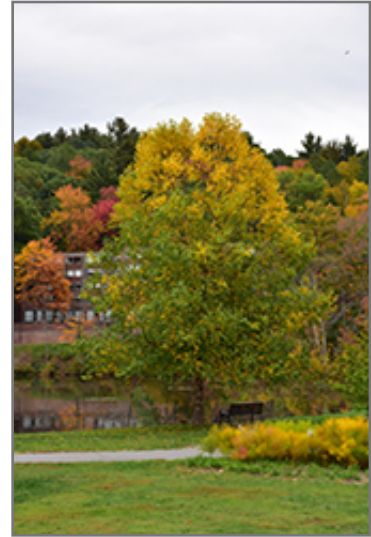
Heritage River Birch in fall

This tree does best in full sun to partial shade. It is quite adaptable, preferring to grow in average to wet conditions, and will even tolerate some standing water. It is not particular as to soil type, but has a definite preference for acidic soils, and is subject to chlorosis (yellowing) of the foliage in alkaline soils. It is highly tolerant of urban pollution and will even thrive in inner city environments. Consider applying a thick mulch around the root zone in winter to protect it in exposed locations or colder microclimates. This is a selection of a native North American species.