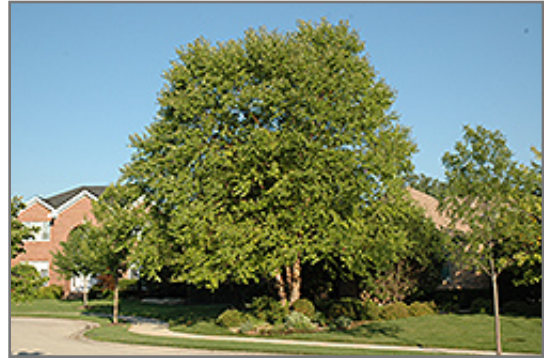
Heritage River Birch

Heritage River Birch is recommended for the following landscape applications;