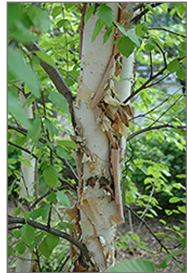
Heritage River Birch bark