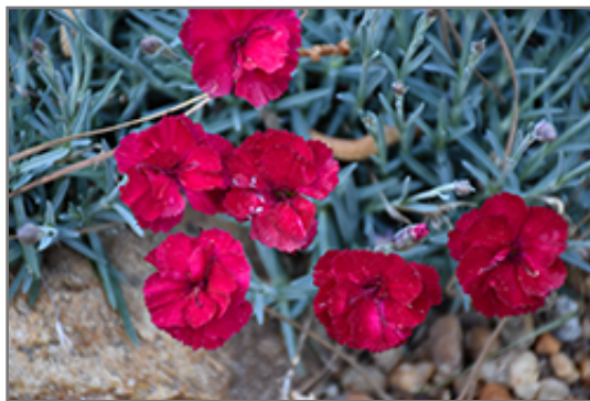
Frosty Fire Dianthus flowers