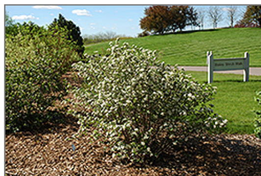
Autumn Magic Black Chokeberry in bloom