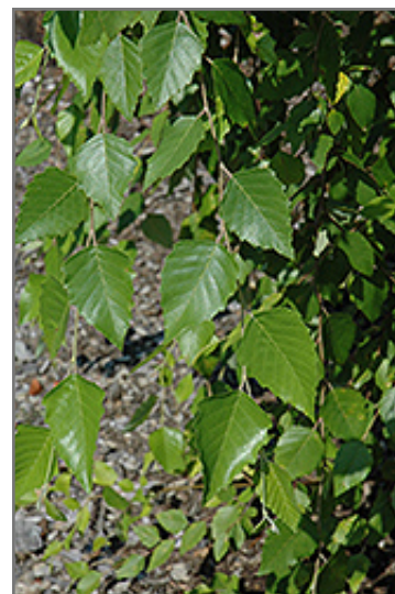
Summer Cascade River Birch foliage