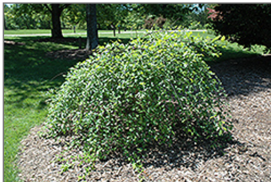
Summer Cascade River Birch

Summer Cascade River Birch is recommended for the following landscape applications;