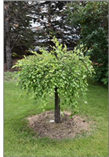
Summer Cascade River Birch

This tree does best in full sun to partial shade. It is quite adaptable, preferring to grow in average to wet conditions, and will even tolerate some standing water. It is not particular as to soil type, but has a definite preference for acidic soils, and is subject to chlorosis (yellowing) of the foliage in alkaline soils. It is highly tolerant of urban pollution and will even thrive in inner city environments. Consider applying a thick mulch around the root zone in winter to protect it in exposed locations or colder microclimates. This is a selection of a native North American species.