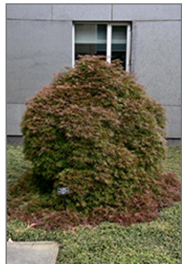
Orangeola Cutleaf Japanese Maple