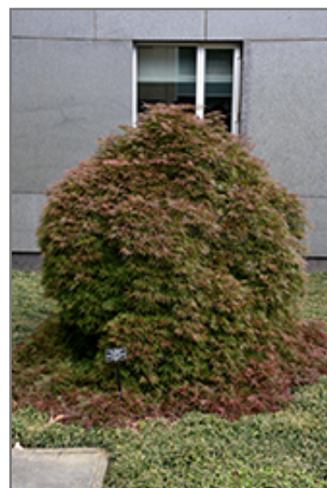
Orangeola Cutleaf Japanese Maple