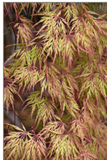
Orangeola Cutleaf Japanese Maple foliage