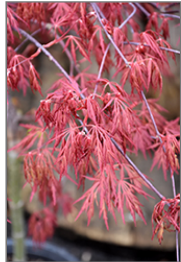
Orangeola Cutleaf Japanese Maple foliage

Orangeola Cutleaf Japanese Maple is a fine choice for the yard, but it is also a good selection for planting in outdoor pots and containers. Because of its height, it is often used as a 'thriller' in the 'spiller-thriller-filler' container combination; plant it near the center of the pot, surrounded by smaller plants and those that spill over the edges. It is even sizeable enough that it can be grown alone in a suitable container. Note that when grown in a container, it may not perform exactly as indicated on the tag - this is to be expected. Also note that when growing plants in outdoor containers and baskets, they may require more frequent waterings than they would in the yard or garden.