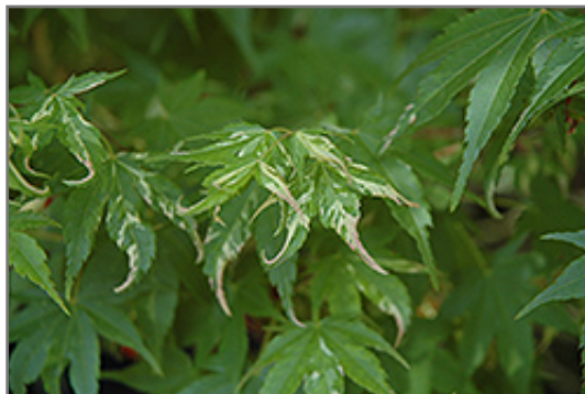
Pink Variegated Japanese Maple foliage