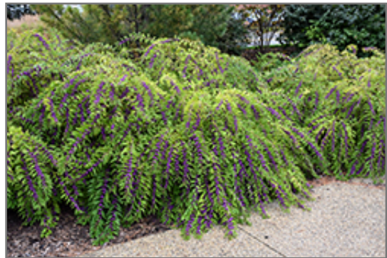
Issai Beautyberry fruit