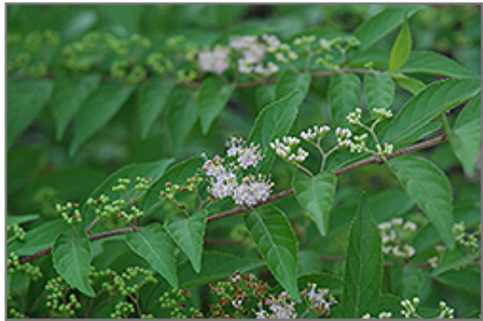
Issai Beautyberry flowers

Issai Beautyberry will grow to be about 4 feet tall at maturity, with a spread of 5 feet. It tends to fill out right to the ground and therefore doesn't necessarily require facer plants in front. It grows at a fast rate, and under ideal conditions can be expected to live for approximately 20 years.