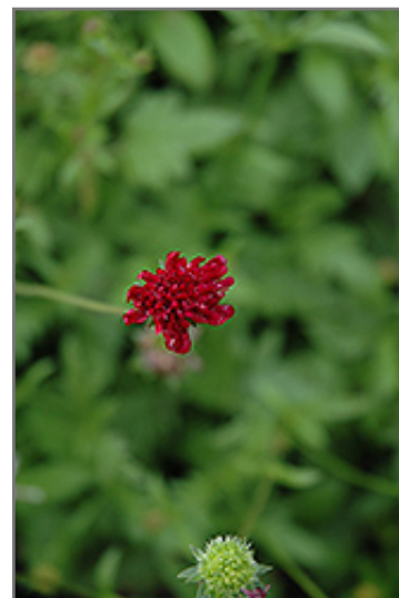
Mars Midget Pincushion Flower flowers