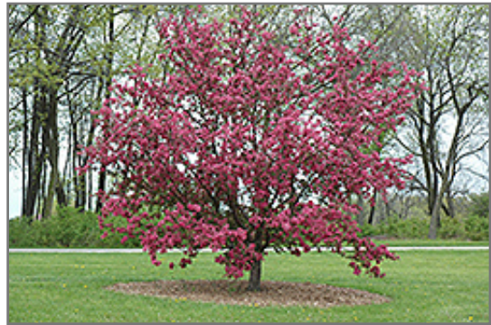
Purple Prince Flowering Crab in bloom

This tree will require occasional maintenance and upkeep, and is best pruned in late winter once the threat of extreme cold has passed. It is a good choice for attracting birds to your yard. It has no significant negative characteristics.