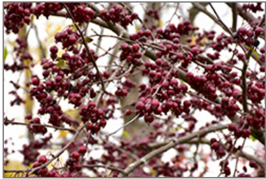
Purple Prince Flowering Crab fruit

This tree should only be grown in full sunlight. It prefers to grow in average to moist conditions, and shouldn't be allowed to dry out. It is not particular as to soil type or pH. It is highly tolerant of urban pollution and will even thrive in inner city environments. This particular variety is an interspecific hybrid.