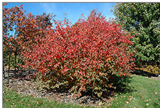
Korean Sun Pear in fall

Korean Sun Pear will grow to be about 15 feet tall at maturity, with a spread of 15 feet. It has a low canopy with a typical clearance of 2 feet from the ground, and is suitable for planting under power lines. It grows at a medium rate, and under ideal conditions can be expected to live for 50 years or more.