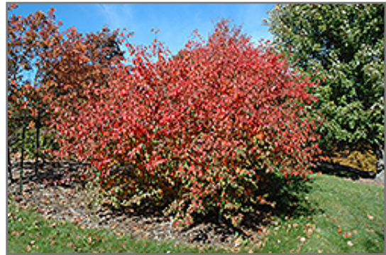
Korean Sun Pear in fall

Korean Sun Pear will grow to be about 15 feet tall at maturity, with a spread of 15 feet. It has a low canopy with a typical clearance of 2 feet from the ground, and is suitable for planting under power lines. It grows at a medium rate, and under ideal conditions can be expected to live for 50 years or more.