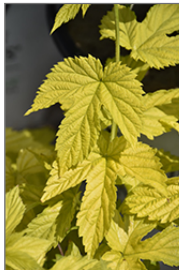
Golden Hops foliage