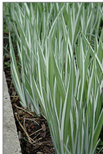
Variegated Japanese Iris

Variegated Japanese Iris is recommended for the following landscape applications;