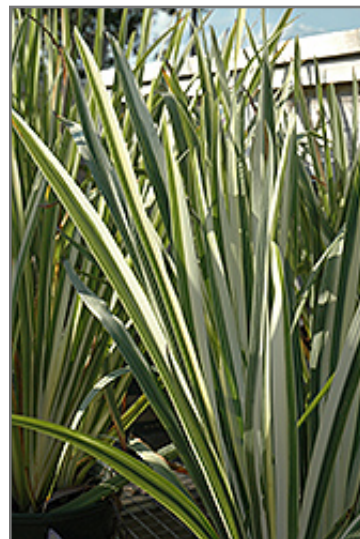
Variegated Japanese Iris foliage