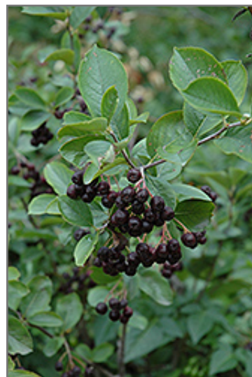
Glossy Black Chokeberry fruit