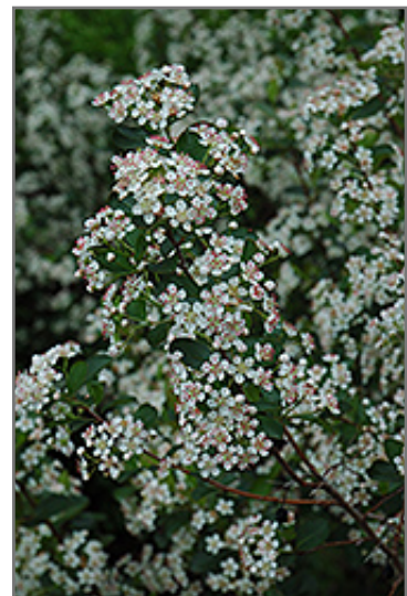
Black Chokeberry flowers