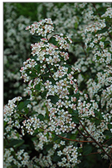
Glossy Black Chokeberry flowers