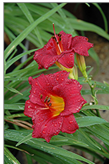
Little Business Dwarf Daylily flowers