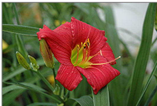
Little Business Dwarf Daylily flowers