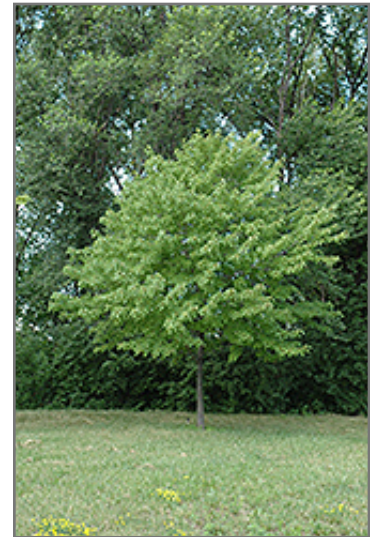
Ruby Frost Red Maple

This tree should only be grown in full sunlight. It is quite adaptable, preferring to grow in average to wet conditions, and will even tolerate some standing water. It is not particular as to soil type, but has a definite preference for acidic soils, and is subject to chlorosis (yellowing) of the foliage in alkaline soils. It is somewhat tolerant of urban pollution. This is a selection of a native North American species.