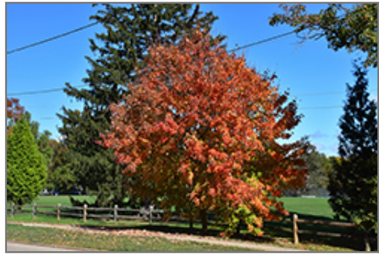
Ruby Frost Red Maple in fall