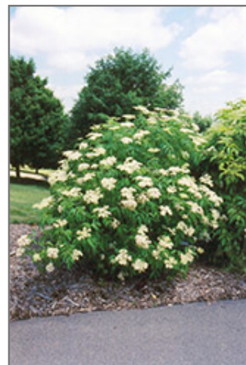
American Elderberry in bloom