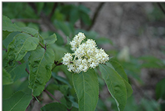
American Elderberry flowers

American Elderberry is recommended for the following landscape applications;