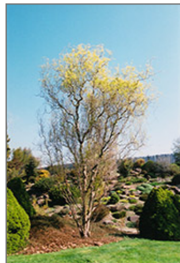
Corkscrew Willow in winter