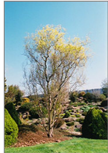
Dragon's Claw Willow in winter