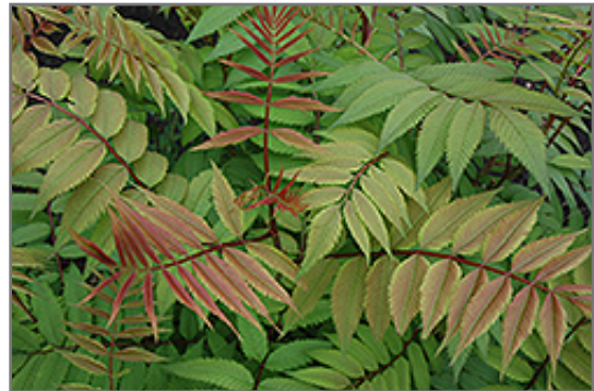
Sem False Spirea foliage