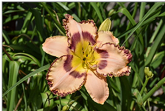
Rainbow Rhythm King Of The Ages Daylily flowers