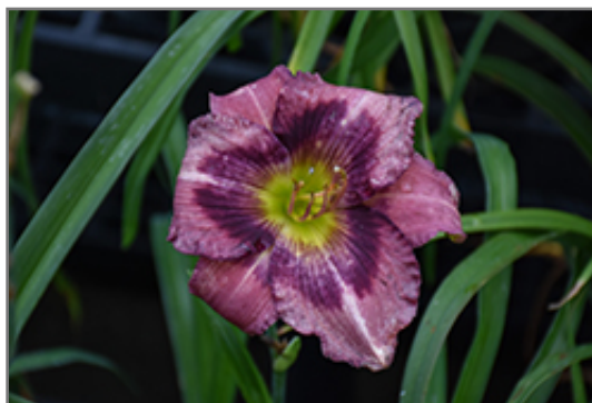
Kansas Kitten Daylily flowers

A compact variety producing large, lavender blooms with dark purple eyes; great grassy texture and form; diploid; a luxurious addition to a smaller garden or border space; midseason bloomer; well branched with high bud count