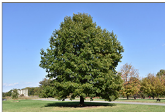
Scarlet Oak