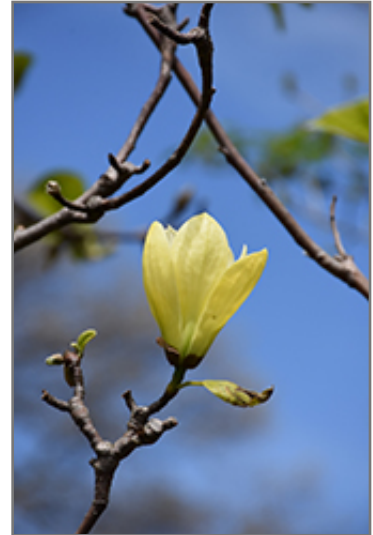
Butterflies Magnolia flowers

This tree does best in full sun to partial shade. It requires an evenly moist well-drained soil for optimal growth, but will die in standing water. It is not particular as to soil type, but has a definite preference for acidic soils. It is quite intolerant of urban pollution, therefore inner city or urban streetside plantings are best avoided. Consider applying a thick mulch around the root zone in winter to protect it in exposed locations or colder microclimates. This particular variety is an interspecific hybrid.