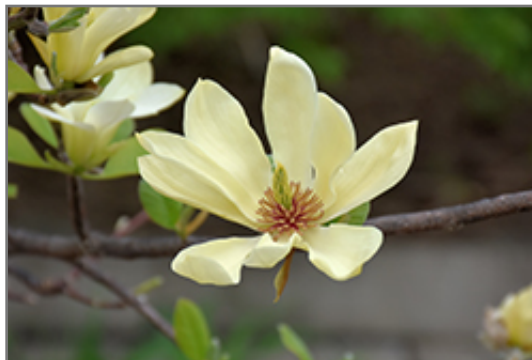
Butterflies Magnolia flowers