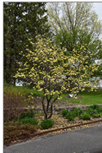
Butterflies Magnolia in bloom