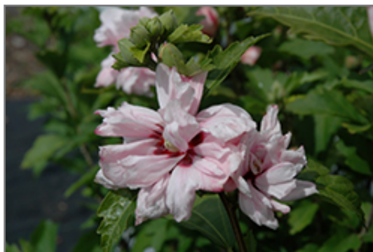
Blushing Bride Rose Of Sharon flowers

Blushing Bride Rose Of Sharon is recommended for the following landscape applications;