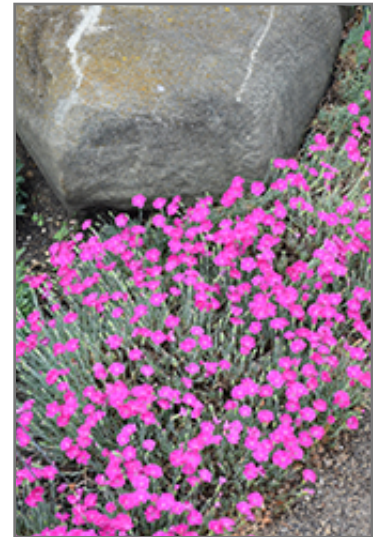
Firewitch Dianthus in bloom

Firewitch Dianthus is a fine choice for the garden, but it is also a good selection for planting in outdoor pots and containers. It is often used as a 'filler' in the 'spiller-thriller-filler' container combination, providing a mass of flowers and foliage against which the thriller plants stand out. Note that when growing plants in outdoor containers and baskets, they may require more frequent waterings than they would in the yard or garden.