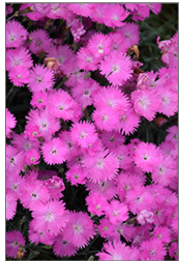
Firewitch Dianthus flowers

Firewitch Dianthus is recommended for the following landscape applications;