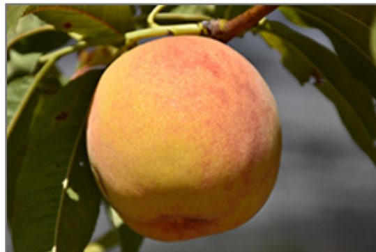
Reliance Peach fruit

Reliance Peach is clothed in stunning clusters of fragrant pink flowers along the branches in early spring, which emerge from distinctive rose flower buds before the leaves. It has dark green deciduous foliage. The narrow leaves turn yellow in fall. The fruits are showy yellow drupes with a red blush, which are carried in abundance in mid summer. The fruit can be messy if allowed to drop on the lawn or walkways, and may require occasional clean-up.