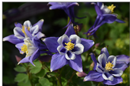
Earlybird Blue and White Columbine flowers