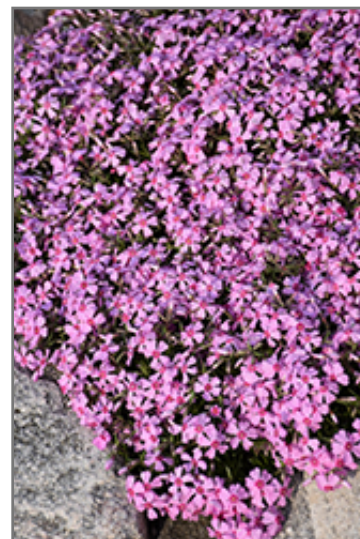
Eye Candy Creeping Phlox in bloom

Eye Candy Creeping Phlox is recommended for the following landscape applications;