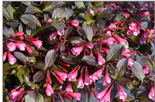
Very Fine Wine Weigela flowers