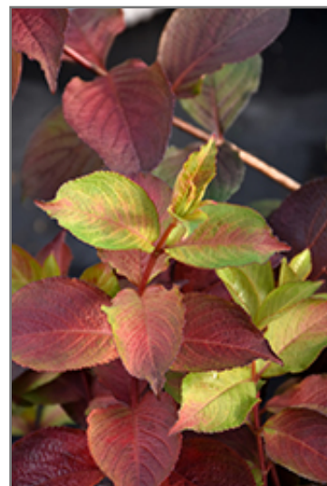
Midnight Sun Reblooming Weigela foliage