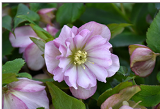
Wedding Party Flower Girl Lenten Rose flowers

Wedding Party Flower Girl Lenten Rose is recommended for the following landscape applications;