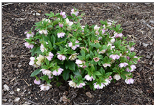
Wedding Party Flower Girl Lenten Rose in bloom