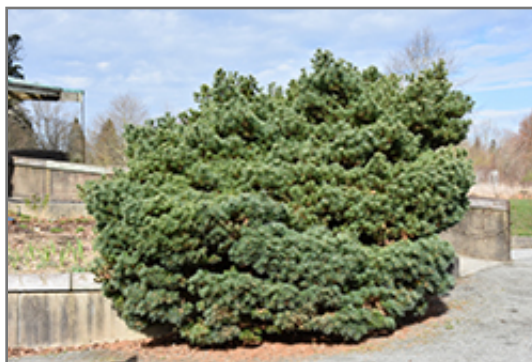
Blue Shag Eastern White Pine