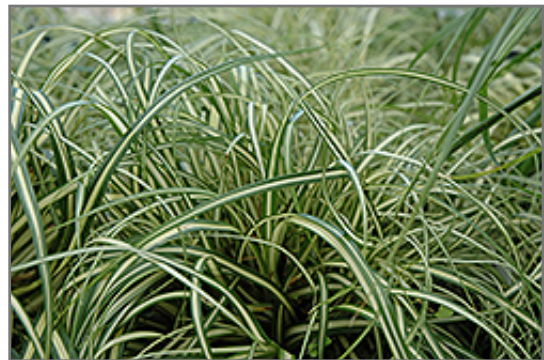
Evergold Sedge Grass foliage

Evergold Sedge Grass is recommended for the following landscape applications;