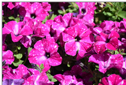
Headliner Enchanted Sky Petunia flowers