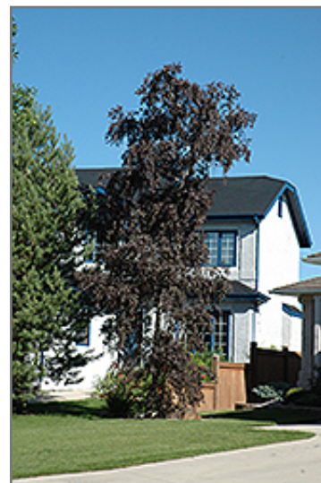
Royal Frost Birch

Royal Frost Birch will grow to be about 30 feet tall at maturity, with a spread of 15 feet. It has a low canopy with a typical clearance of 3 feet from the ground, and should not be planted underneath power lines. It grows at a fast rate, and under ideal conditions can be expected to live for 40 years or more.