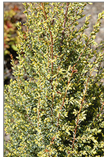
Gold Cone Juniper foliage