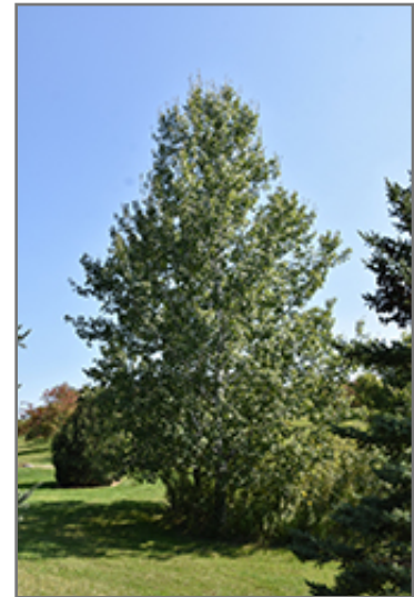
Quaking Aspen

Quaking Aspen is recommended for the following landscape applications;