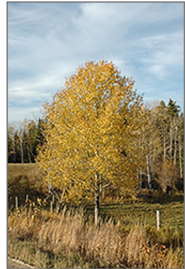
Quaking Aspen in fall

This tree should only be grown in full sunlight. It is an amazingly adaptable plant, tolerating both dry conditions and even some standing water. It is considered to be drought-tolerant, and thus makes an ideal choice for xeriscaping or the moisture-conserving landscape. It is not particular as to soil type or pH. It is quite intolerant of urban pollution, therefore inner city or urban streetside plantings are best avoided. This species is native to parts of North America.