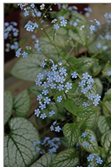
Jack Frost Brunnera flowers